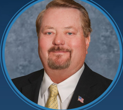
In God is my salvation and my glory; The rock of my strength and my refuge, is in God.