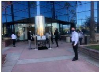
ATC public entrance is ready with self-service kiosks and printers, along with friendly staff ambassadors.