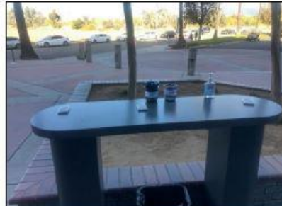
Calculators, single-use pens, and sanitizer ready for taxpayer use.