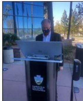
ATC invented these self-service property tax payment kiosks. They are contactless, speed up processing times, and promote social distancing.