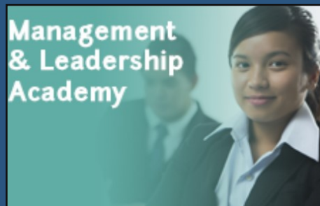
MLA trains future County stars.

In 1996, the San Bernardino County Board of Supervisors, Chief Administrative Office and department heads established the Management and Leadership Academy (MLA) to provide comprehensive management and leadership training to County employees. Those participating in MLA gain theoretical and practical knowledge of public service management and leadership practices, with specific emphasis on understanding their application within San Bernardino County.