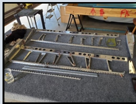
Skeletal structure of the left and right elevators of the Van's RV 14 Aircraft.

My grand project of building a plane has become bigger than I first believed. Of course, there is a lot on the line when you put yourself and your loved ones in something and shoot it into the air.