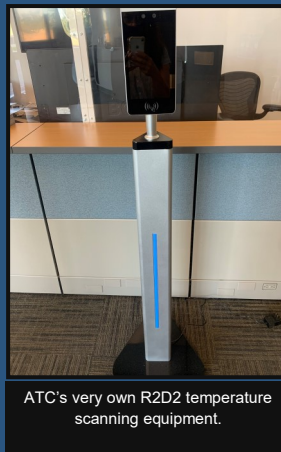
ATC's very own R2D2 temperature scanning equipment.

For information about ATC safety procedures and policies, please contact Tracy Calentti at tracy.calentti@atc.sbcounty.gov .