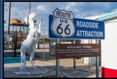
Horsing around in Amboy, CA!